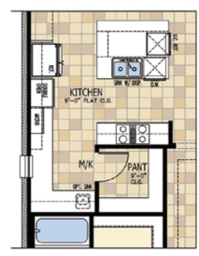
optional gourmet kitchen