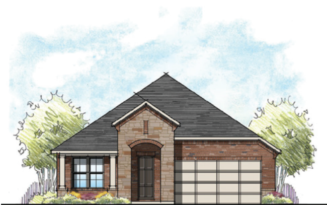
LILY (B) - 2,179 SF