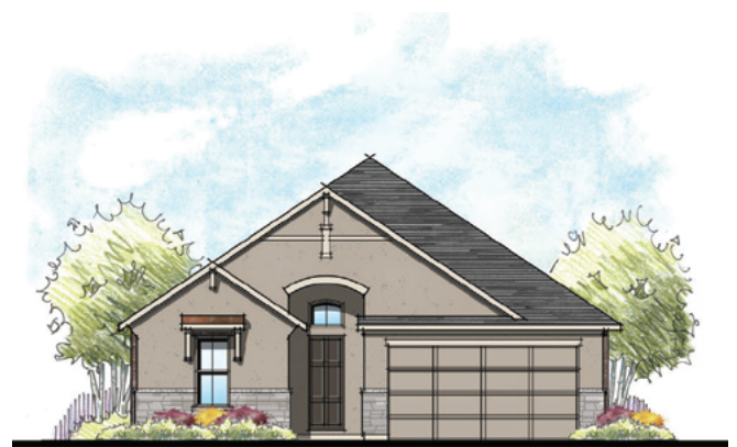
LILY (C) - 2,179 SF