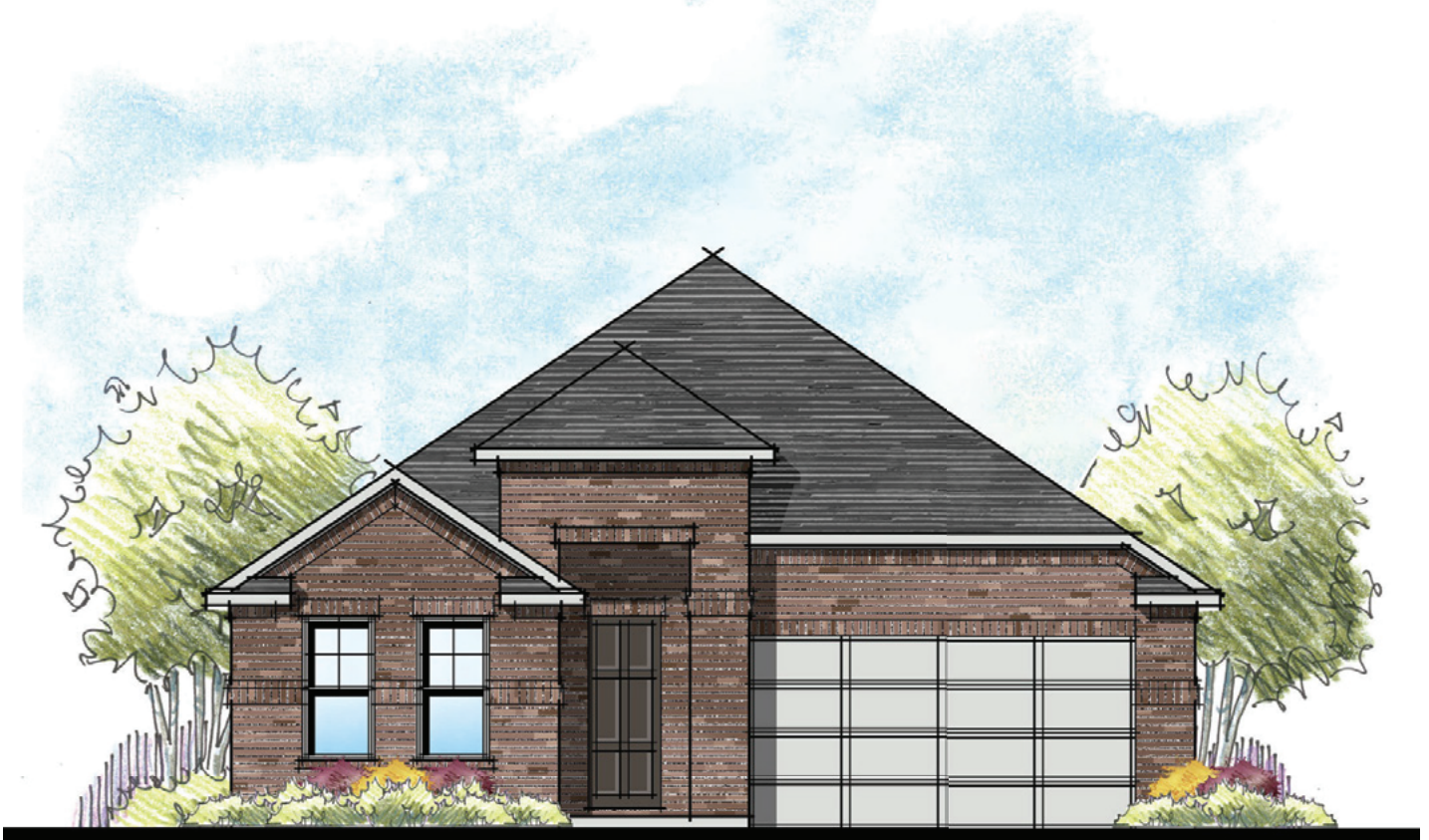
LILY (A) - 2,179 SF